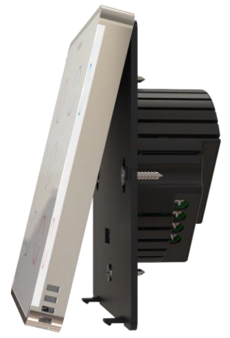
Figure 3: Install Touch Panel Unit

Note: Zero-Cross technology is unavailable if the device operates using DC voltage (24-48VDC).