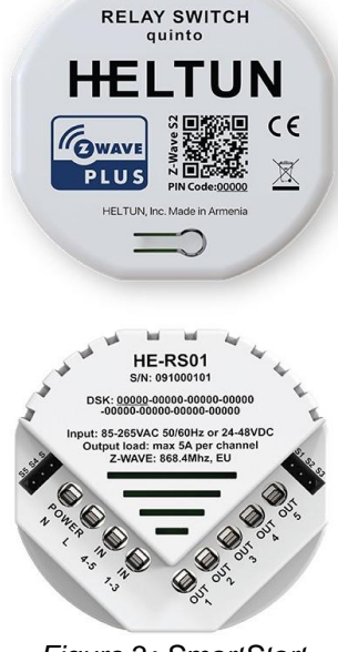
Figure 3: SmartStart QR Code & DSK

Group 4 – "External Input S2 Basic Set": is assigned to Input S2 state and will be triggered when the button on switch connected to S2 input was pressed. Is used to send Basic Set ON (value 255) and Basic Set OFF (value 0) commands to the associated devices. The group supports one Node.